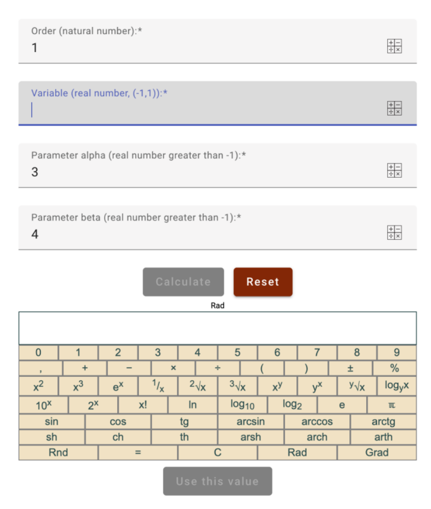
Fig. 1 – Input form for Jacobi polynomials.