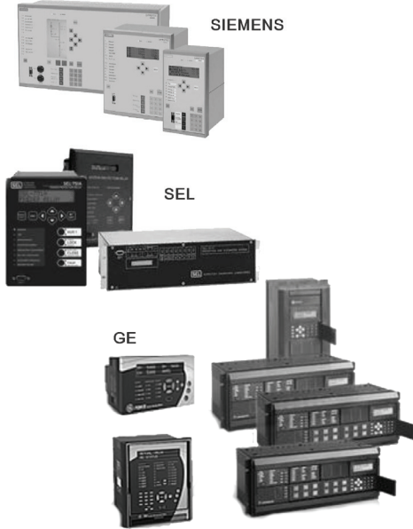
Fig. 1 – Configuration of Modern MPDs of Different Brands.

Usually separate MPDs are installed in relay cabinets: 3 – 5 units in each cabinet, Fig. 2.