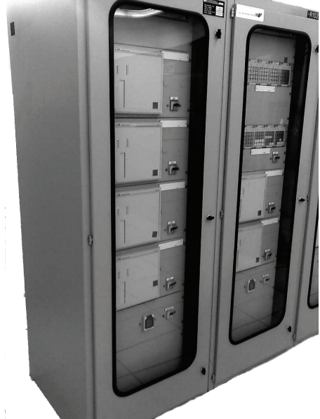
Fig. 2 – Method of MPD Installation into Cabinets in Use Today.

Historically, [5] there are a large number of non-interchangeable and incompatible MPD designs. This means that if a certain module of any MPD installed in the particular substation or power station fails, it can be replaced only by the same component, produced by the same manufacturer. Thus, after spending a small fortune purchasing an MPD from a specific manufacturer, one falls into economic dependence on this manufacturer for the next 10–15 years, since after having chosen one manufacturer it no longer makes any difference if there are other manufacturers in the market, as one cannot use their products. And the only way to get out of this is to pay a small fortune one more time for the MPD from another manufacturer (and, thus, switching from one bondage to another). And what does the manufacturer do with an absolute monopoly? Right: the manufacturer increases the price! The price of one spare MPD module can reach almost one-third or even a half of that of the entire MPD! As